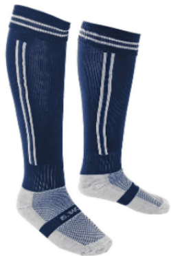
BBG P.E. Socks £6.50 – £7.00