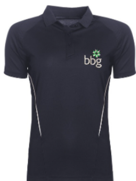
BBG Girls P.E. Polo Shirt £13.00 – £15.50