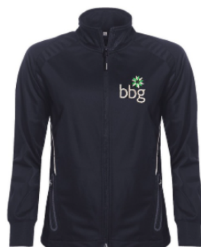
BBG Girls Full Zip P.E. Training Top £18.50 – £22.50