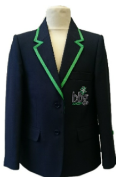
BBG Girls Blazer £33.00 – £39.00