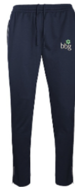
BBG P.E. Tracksuit Pants £20.00 – £23.50