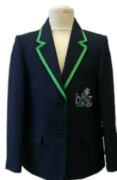
BBG Boys Blazer £33.00 – £39.00