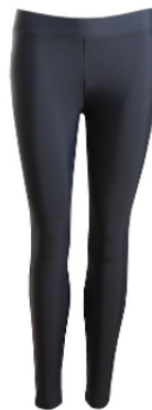
BBG Girls P.E. Leggings £13.00 – £16.00