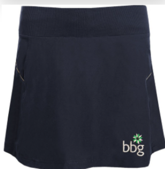
BBG Girls P.E. Skort £15.50 – £19.00