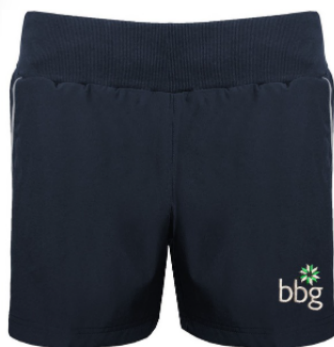
BBG Girls P.E. Shorts £11.00 – £14.00