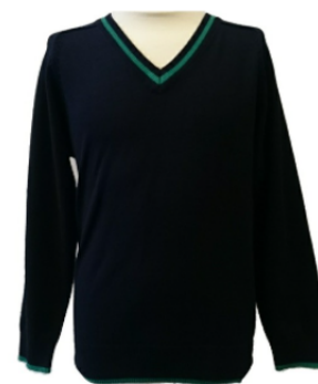
BBG Knitted Unisex Jumper £16.00 – £19.50