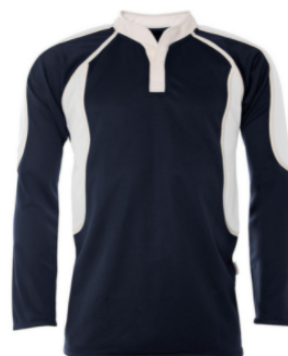
BBG Boys Reversible Outdoor P.E Top £18.50 – £20.50