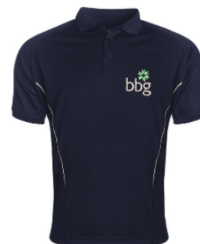
BBG Boys P.E. Polo Shirt £13.00 – £15.50