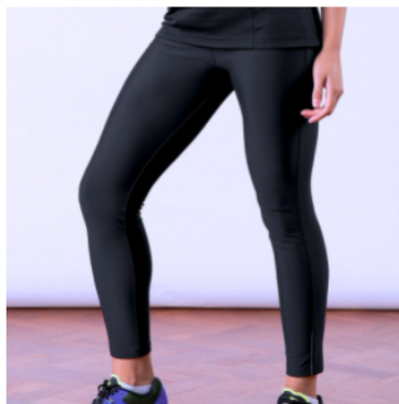
BBG Girls Essentials Leggings £13.50