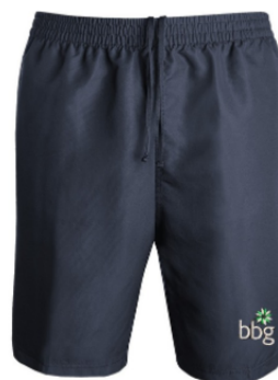
BBG Boys P.E. Shorts £11.00 – £14.00