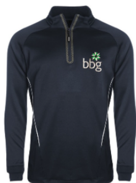
BBG 1/4 Zip Boys P.E. Training Top £18.50 – £21.50